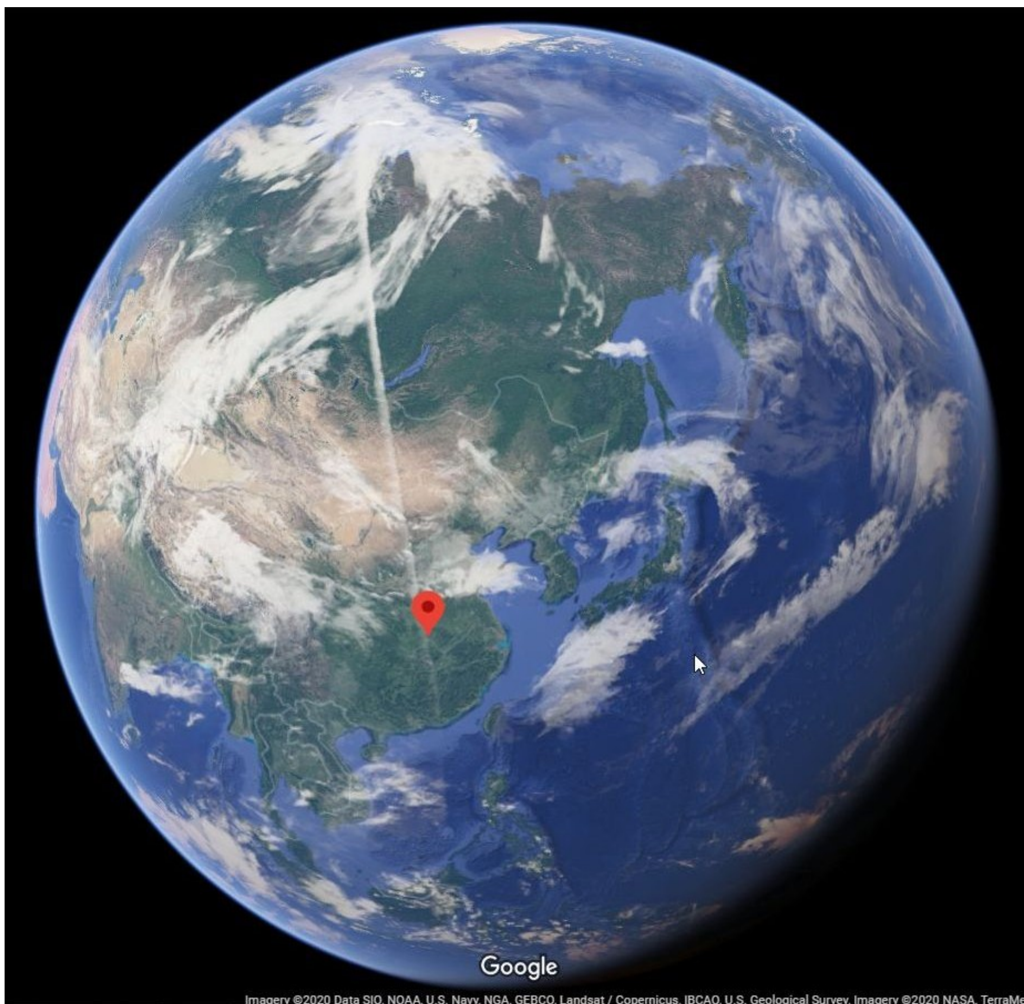
Figure no.1 The northern hemisphere segment of the linear cloud; red: Wuhan-China, 114°E/30°N Google Earth 3D Globe

At the time when the sunrise line reaches the Wuhan city line again, the Sun is in the middle of the Pacific tectonic vortex (155°W), and when the sunrise reaches the 65°W meridian, the Sun is in the middle of the Africa tectonic vortex (25°E). At these moments, the two vortices are under the maximum influence of the external source - the Sun, alternately at 12 hours, and the cirrus linear cloud no longer has conditions of formation neither in the northern nor in the southern hemisphere for 4 hours, during the periods of transition.