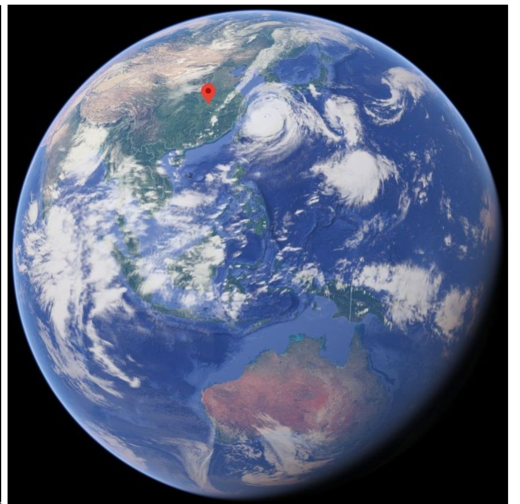
Figure no.3 The central segment of the linear cloud formation path; red: Wuhan-China, 114°E/30°N Google Earth 3D Globe